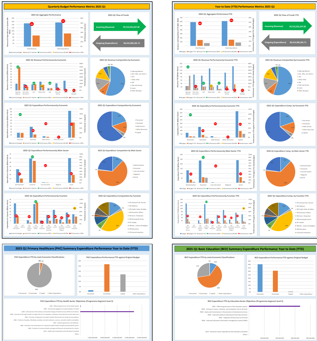
Figure 1: Fiscal Performance Overview for Quarter